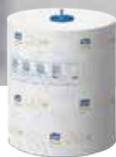
Tork Matic® Hand Towel Roll Refill