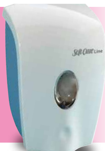
Soft Care Line Dispenser