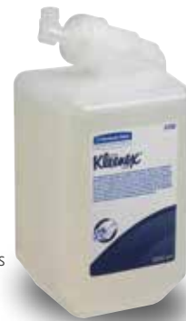
KLEENEX ® Antibacterial Hand Cleanser