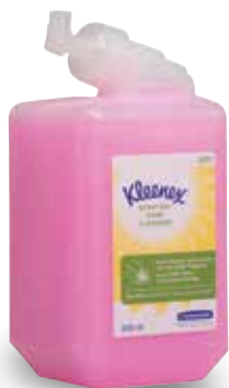
KLEENEX ® Everyday Use Hand Cleanser