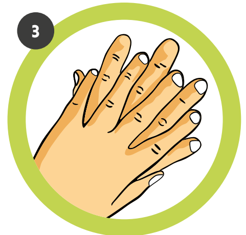
Spread the lather over the backs of the hands