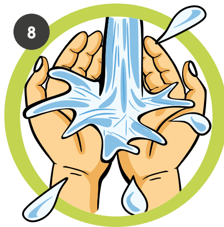
Rinse hands with water