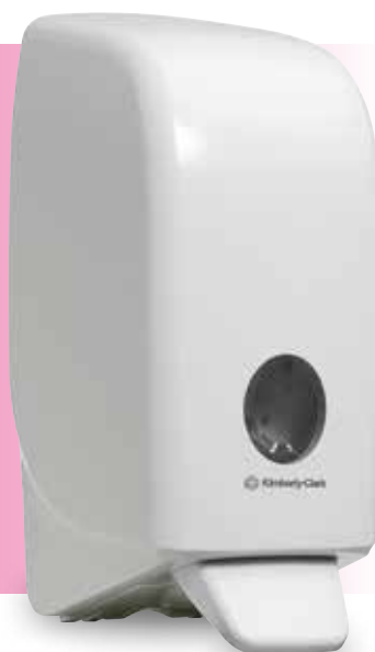
AQUARIUS ® Liquid & Foam Hand Cleanser Dispenser

The refill cassettes are designed for quick and easy installation with a simple push and click. When the cassette is empty, it can be compressed to conserve space and is fully recyclable once the pump is removed.