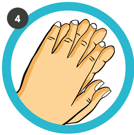
Make sure the soap gets in between the fingers