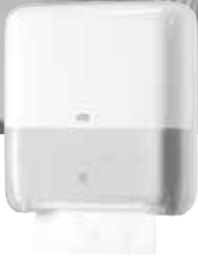
Tork Matic® Hand Towel Roll Dispenser