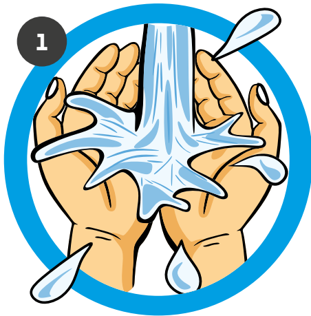
Wet hands under running water