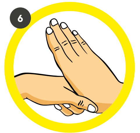
Pay particular attention to the thumbs