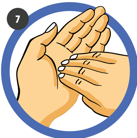
Press fingertips into the palm of each hand