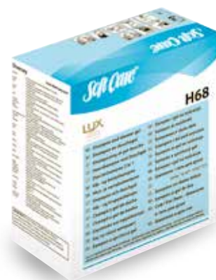
Soft Care Lux 2 in 1 Hair and Body Wash