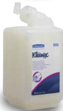
KLEENEX ® Hair and Body Shower Gel