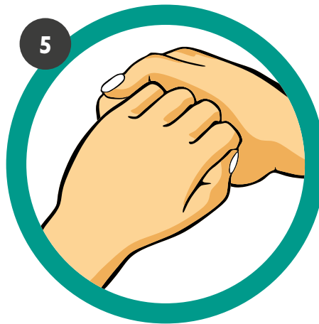
Grip the fingers on each hand