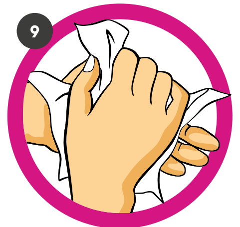
Dry thoroughly with a clean towel