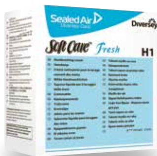
Soft Care Fresh H1 Handwash